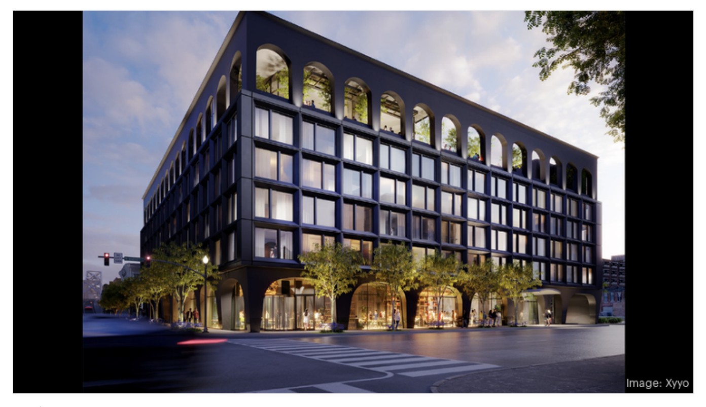
The $60 million project will bring 168 rooms across five stories.

The hotel comes from two developers: Minnesota-based TruVine Companies and Zyyo, which has offices in Louisville and New York City.